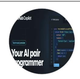
New code using GitHub Copilot